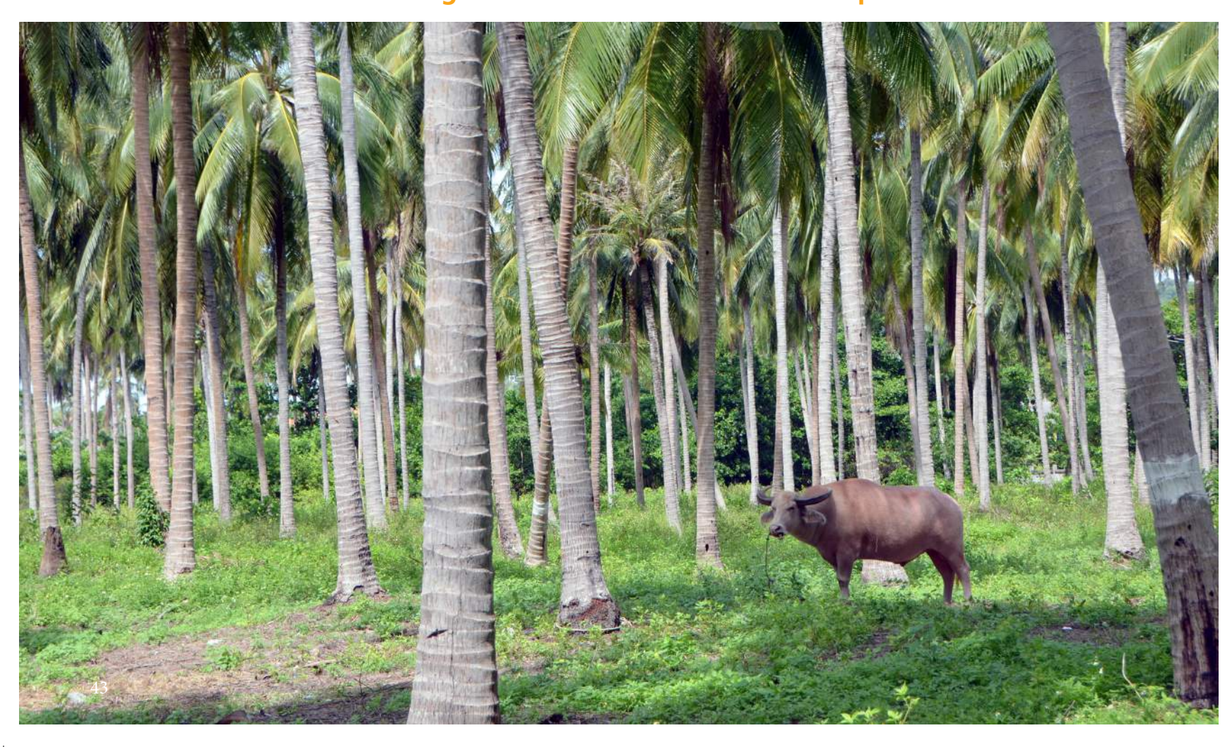
"Koh Samui Is the third largest island in Thailand at 280 square kms"

Koh Samui is the third largest island in Thailand at 280 square kms. It has a population of 50,000 but welcomes approximately 1 million visitors a year looking for sun and fun primarily on the long eastern beaches. The interior is tropical jungle and hills covered by millions of well-established coconut trees.